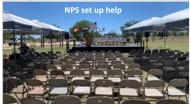
NPS set up help