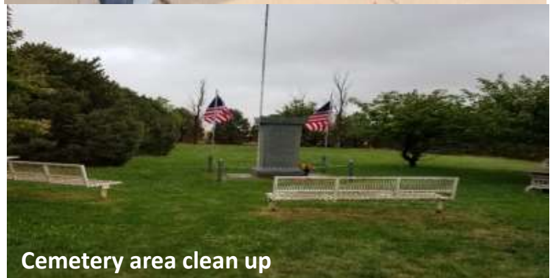
Cemetery area clean up

Remember! We are guests so please watch your vehicle speed in town