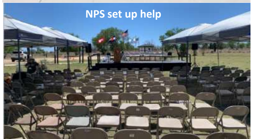
NPS set up help